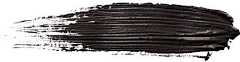
Warm Black 18ml cod. E15-34 7ml cod. E5-34

Warm Black: Permanent makeup color for eyes and eyeliner. Biotek's Warm Black pigment is an intense and warm black, ideal for graphic eyeliner and infralashes.