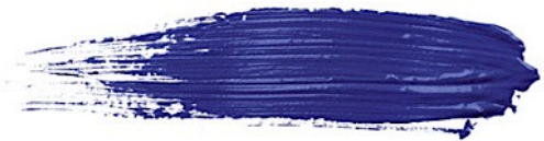
Deep Ocean 18ml cod. E15-40 7ml cod. E5-40

Warm Brown: Permanent makeup color for eyes and eyeliner. Biotek's Warm Brown pigment is a rich and intense brown, ideal for graphic eyeliner and infralashes on blonds.