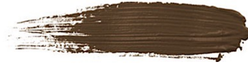
Paris 18ml cod. E15-08 Neutral Brown 7ml cod. E5-08

Neutral brown color for eyebrows. Paris has a neutral tendency which makes it ideal for working on all neutral skins with brown eyebrows.