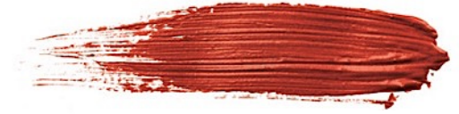
Mineral Red 18ml cod. E15-19 7ml cod. E5-19

Orange is a mixing color / modifier for permanent make-up and microblading pigments. Biotek's Orange color can be added to another color, in the capsule, to make it warmer.