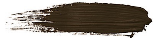
Warm Brown 18ml cod. E15-36 7ml cod. E5-36

Royal Black: Permanent makeup color for eyes and eyeliner. Biotek's Royal Black pigment is a long-lasting intense black, ideal for graphic eyeliner and infralashes.