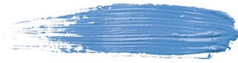
Blue Sky 18ml cod. E15-38 7ml cod. E5-38

Deep Ocean: Permanent makeup color for eyes and eyeliner. Biotek's Deep Ocean pigment is an intense blue, ideal for a graphic eyeliner or a shaded eyeliner.