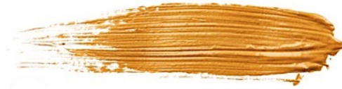
Yellow 18ml cod. E15-17 7ml cod. E5-17

Yellow: is a mixing color for permanent make-up and microblading pigments. Biotek's Yellow color must be added to another color in the capsule to make it lighter.