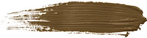
Madrid 18ml cod. E15-04 Cold Light Brown 7ml cod. E5-04

Cold blond color for eyebrows. Hollywood has a slight green tendency. Ideal for working on fair skins with red undertones or for correcting blond eyebrows, slightly turning red.