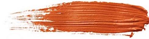
Orange 18ml cod. E15-18 7ml cod. E5-18

Yellow: is a mixing color for permanent make-up and microblading pigments. Biotek's Yellow color must be added to another color in the capsule to make it lighter.