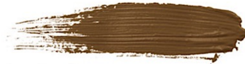
San Paolo 18ml cod. E15-06 Warm Light Brown 7ml cod. E5-06

Warm blond color for eyebrows. Berlin has a slight red tendency. Ideal for working on fair skins with a cold undertone, or for correcting eyebrows slightly turned to gray.