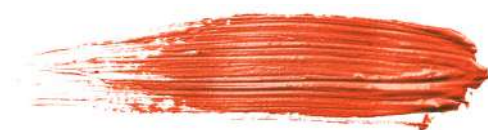
Casinò 15 ml cod. E15s-52

Sexy is a fier red lip color. A great classic, the red lipstick, emblem of femininity and sensuality.