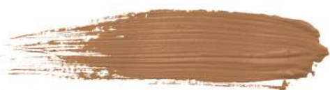
Tan 1 15 ml cod. E15s-31

Medium 3 is a skin color for permanent makeup and microblading. Biotek Medium 3 pigment is an intermediate skin color with a slight yellow undertone.