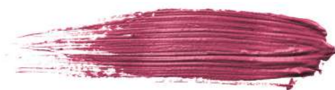
Super Model 15 ml cod. E15s-45

Lollipop is a intermediate purplish pink lip color. Perfect and versatile to be shown off on any occasion.