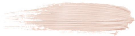
Fair 1 15 ml cod. E15s-25

Fair 1 is a skin color for permanent makeup and microblading. The Fair 1 pigment from Biotek is a very light skin color, with a slight pinkish tendency.