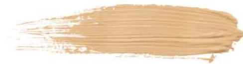
Medium 3 18 ml cod. E15s-30

Medium 2 is a skin color for permanent makeup and microblading. Biotek Medium 2 pigment is an intermediate skin color with a slight yellow undertone.