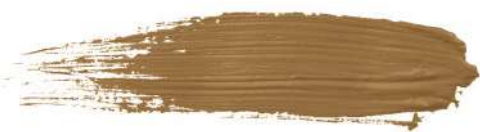
Mimosa ● 15 ml cod. E15s-60 Neutral Blond

Beautiful honey blonde. Mimosa pigment has a neutral undertone, which makes it perfect for use on all blonde clients, with fair skin phototype (Fitzpatrick 1) and natural really blond brow hair.