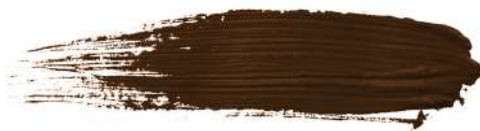
Bellini ● 15 ml cod. E15-69 Warm Extra Dark Brown

Dark brown. Hybrid, long lasting formula. This color appears warm but will heal neutral.