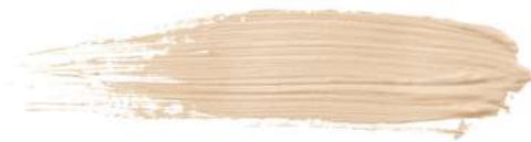
Medium 2 15 ml cod. E15s-29

Medium 1 is a skin color for permanent makeup and microblading. Biotek Medium 1 pigment is an intermediate skin color with a slight yellow undertone.