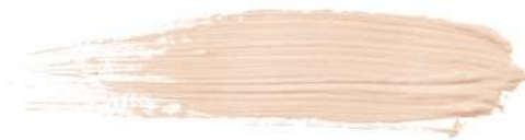
Fair 2 15 ml cod. E15s-26

Fair 1 is a skin color for permanent makeup and microblading. The Fair 1 pigment from Biotek is a very light skin color, with a slight pinkish tendency.