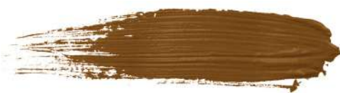
Spritz ● 15 ml cod. E15-65 Warm Blond

Light blond. Hybrid, long lasting formula. This color appears warm but will heal neutral.