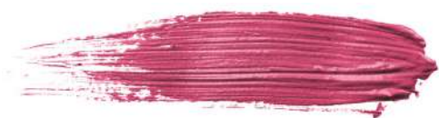
Lollipop 15 ml cod. E15s-44

Love is a medium pink lip color, that right touch of color to wear on any occasion.