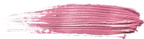
Parfum 15 ml cod. E15s-46

Parfum is a natural antique pink lip color.