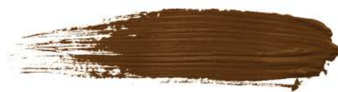
Margarita ● 15 ml cod. E15-67 Warm Brown

Dark blond/ Light brown. Hybrid, long lasting formula. This color appears warm but will heal neutral.