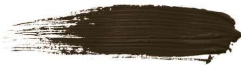
Cosmopolitan ● 15 ml cod. E15s-64 Neutral Extra Dark Brown

Beautiful dark brown. Martini pigment has a neutral undertone, which makes it perfect for use on all clients with medium to dark skin (phototype Fitzpatrick 4 - 5) and natural dark brown brow hair.