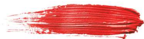
Sexy 15 ml cod. E15s-51

Sexy is a fier red lip color. A great classic, the red lipstick, emblem of femininity and sensuality.