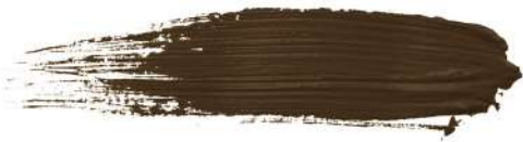
Martini ● 15 ml cod. E15s-63 Neutral Dark Brown

Beautiful medium brown. Sex on the Beach pigment has a neutral undertone, which makes it perfect for use on all clients with intermediate skin (phototype Fitzpatrick 3-4) and natural medium brown brow hair.