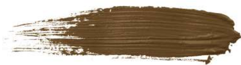
Ibiza ● 15 ml cod. E15s-05 Neutral Light Brown

Neutral blond color for eyebrows. Moscow is ideal for working on fair skin and blond eyebrows. The color has a prevalence of yellow and a neutral undertone.