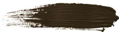
Venice ● 15 ml cod. E15s-14 Neutral Extra Dark Brown

Neutral dark brown color for eyebrows. Milan has a neutral tendency which makes it ideal for working on all neutral skins with dark brown eyebrows. Do not use it on warm or cold skin undertones.