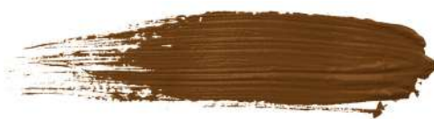
Piña colada ● 15 ml cod. E15-66 Warm Ligth Brown

Light blond. Hybrid, long lasting formula. This color appears warm but will heal neutral.