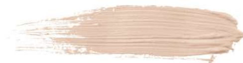
Fair 3 15 ml cod. E15s-27

Fair 2 is a skin color for permanent makeup and microblading. The Fair 2 pigment from Biotek is a very light skin color, with a slight pinkish tendency.