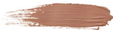
Tan 2 15 ml cod. E15s-32

Tan 1 is a skin color for permanent makeup and microblading. The Tan 1 pigment by Biotek is a deep skin color with a slight orange tendency.