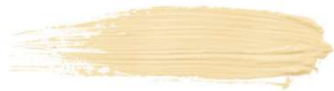
Medium 1 15 ml cod. E15s-28

Fair 3 is a skin color for permanent makeup and microblading. The Fair 3 pigment from Biotek is a light skin color, with a slight pinkish tendency.