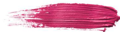
Rebel 15 ml cod. E15s-49

Supermodel is a lip color with raspberry vibes.