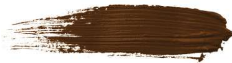
Mojito ● 15 ml cod. E15-68 Warm Dark Brown

Medium brown. Hybrid, long lasting formula. This color appears warm but will heal neutral.