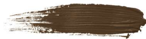
Sex on the beach ● 15 ml cod. E15s-62 Neutral Brown

Beautiful dark blond / light brown. Moscow Mule pigment has a neutral undertone, which makes it perfect for use on all clients with light skin (phototype Fitzpatrick 2) and natural dark blond brow hair.