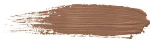
Tan 3 15 ml cod. E15s-33

Tan 2 is a skin color for permanent makeup and microblading. The Tan 2 pigment by Biotek is a deep skin color with a slight orange tendency.